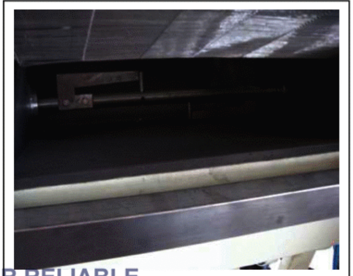
SMALL CHOCOLATE MIXING TANK